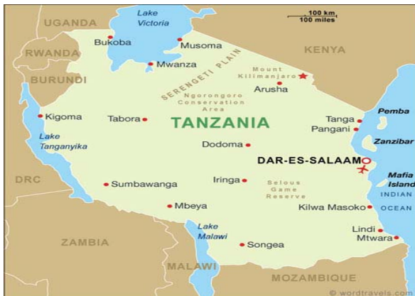
Map of Tanzania showing regions

The selected Team of 40 facilitators who are science teachers from different parts of the country and other invited academicians from University of Dar es salaam has been facilitated on CRC concepts as well as CRC articles