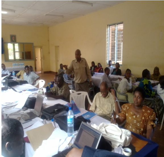
Science Teacher facilitates discussion about girls students in learning Natural Science Subjects