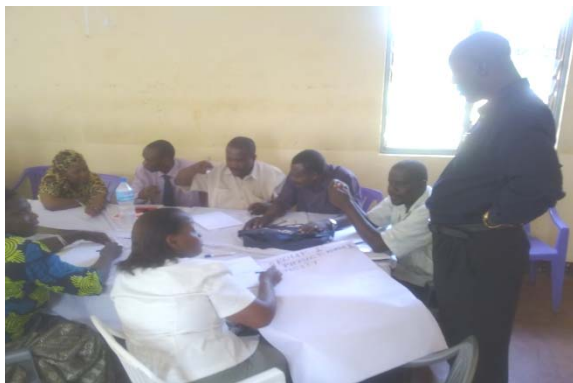
Facilitation of CRC project at Kilakala Secondary School in Morogoro Region

The selected team also has been facilitated on the project of participation of girls in learning science subjects at secondary school