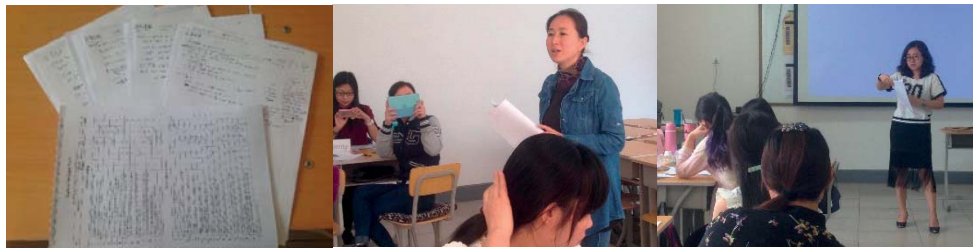
Feedback from change agents