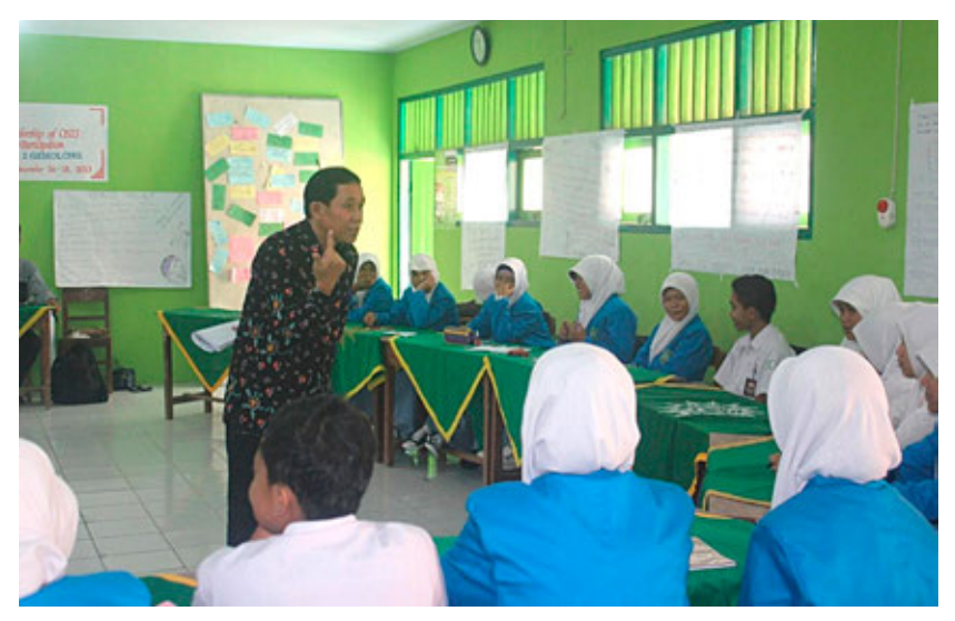
Change Agents & OSIS conducted workshop on participation.

The challenges are, however, implementing the joyful, active, collaborative teaching methods, changing parents and teachers' perspective on how to educate the learners, making the parents aware of the importance of supporting the learners in school activities. Based on the problems, there are several ways needed, namely eliminating the corporal punishment, but reward and consequences, making them aware that they have to know the consequences if they break the rules, discussing intensively with the parents using many techniques, such as how to discipline the learners, conducting workshop on child friendly school to change the teachers and parents' mindset, and involving the learners in making decision.