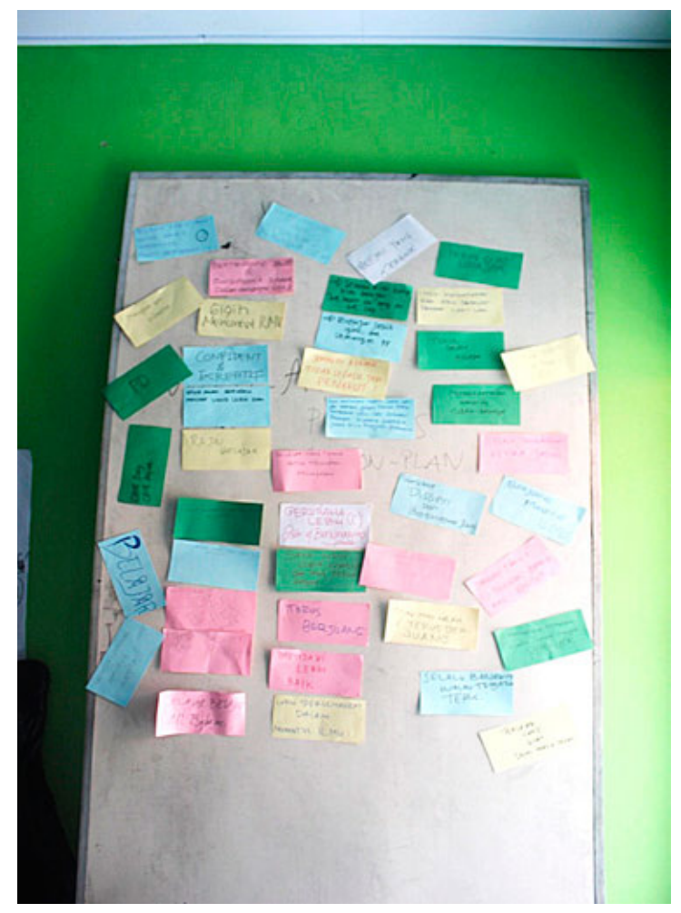
OSIS' ideas and voices to be delivered to school management. Source: Batch 19 Change Agents.

c. Students Organization OSIS had exercised the capacity to manage the project via writing proposal to be given to the Principal via this project. This workshop was conducted weekly in February that is every Friday: 7, 14, 21, 28 February 2014. Bi-weekly were supervised by the whole team of change agents. Students met and expressed their views not only in form of proposals but also in form of artistic expression such as sketching, theatre, and music performance. Students organized events based on their initiatives. Previously they were being dictated by the teachers, but after the workshop they planned the initiative and proposed the initiatives to the schools.