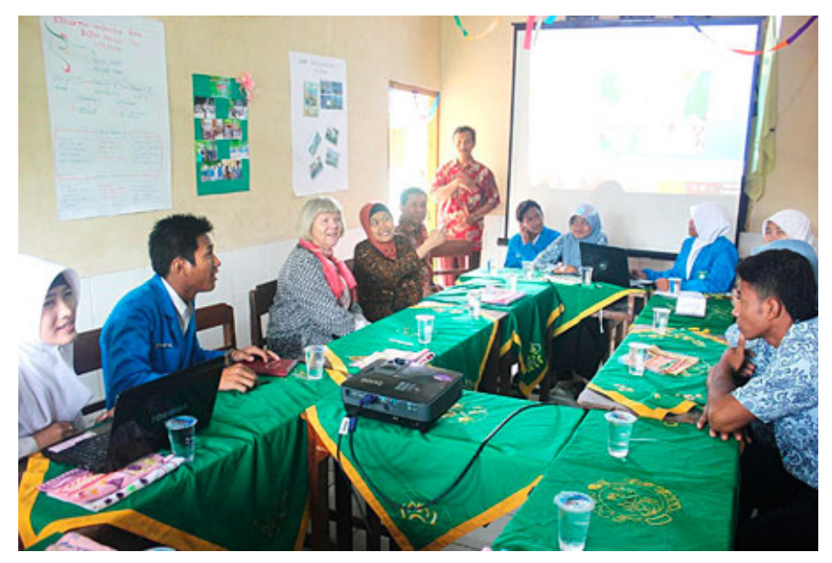
Bodil & Change Agents are visiting OSIS'Offices.