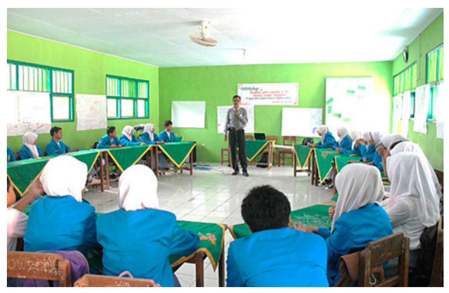
Change Agents were having FGD with OSIS.

Muhammadiyah and Aisyiyah has collaborated with KAPAS (NGO dealing with children having problems with the law) supporting advocacy for cases of sexual violence and harassments. Building perspective and children's participation is becoming the highest challenges. The commission needs the following: policy to be implemented in the scope of city and regency; networking with the government, coordination and communication as well as forum for CRC, more research on CRC, building commitment, technical assistance, integration of CRC into the curriculum, school rules shall involve children's participation, building synergy between children and family.